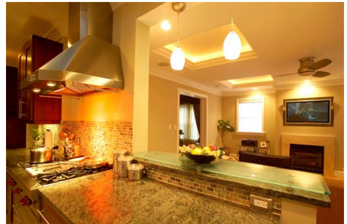
AFTER – View of glass countertop.

and new Oak flooring was feathered in for a seamless family room transition from old to new. The glass tile which chosen by the owner and shipped from Italy, features gold leaf. On the breakfast counter between the kitchen and family rooms is a unique and striking glass shelf ( See below ).