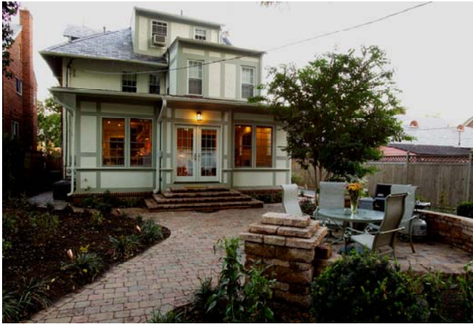
AFTER – Rear addition & stone patio