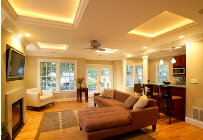
“..... cove lighting tie the kitchen and family room together”

The kitchen has a striking mix of shaker style Cherry cabinets, stainless steel appliances, Granite counters, large ceramic floor tiles on the diagonal and a unique glass tile backsplash.