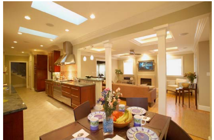
After – Traffic flow was also improved between kitchen and family room areas.

The goal of these homeowners was a larger and more functional eat-in area in the kitchen and a new large family room. The customer was very concerned about having enough natural light and integrating the back yard with the addition. It was also important that the addition integrate aesthetical with the rest of the house. To do this we had to remove a smaller existing family room that did not look out on the back and a dark tiered kitchen ( See below ).