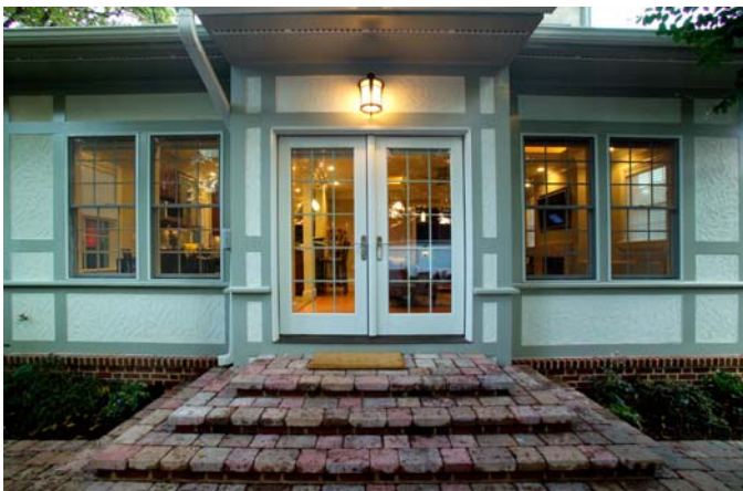
AFTER – New rear facade

Attention to construction and finishing details is evident inside and out of this addition. The unique stucco pattern on the addition was carefully installed and painted to match the stucco on the existing house. The brick knee wall and the exterior trim were also carefully chosen and installed to match the existing ( See below ).