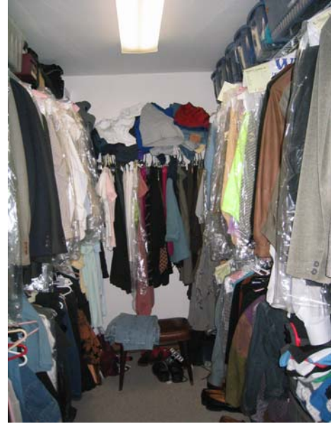
BEFORE VIEW – Master Bedroom – Closet