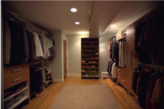
AFTER VIEW – Master Bedroom – Walk-In Closet