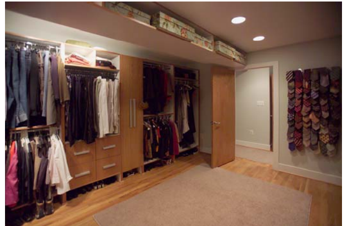
AFTER VIEW – Master Bedroom – Walk-In Closet

The adjacent master bedroom closet was designed to let the fashion designer and her husband keep all of their nicest garments in a convenient and warm changing area. The custom cabinets include shoe storage along the entire toe kick area. An innovative storage shelf was built at the ceiling to accommodate the owners’ storage boxes. (See pictures right & next page).