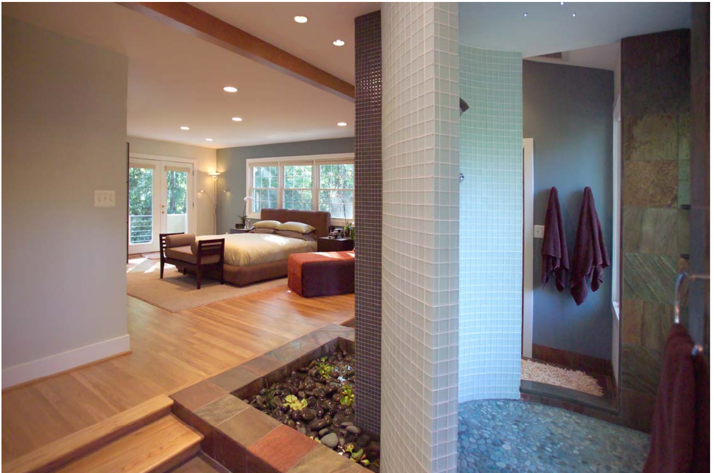
AFTER VIEW – Master bedroom and shower glass enclosure

When the project was complete, the homeowner wrote, “I would say people’s jaws drop when they see the place.” She also wrote, “[The] Verizon guys told me our house was in the top 10 -- and they said they have been in [a lot of] huge mansions.” Within our firm, we are particularly proud of this bathroom because the space elicits a unique range of emotions. The Zen like feeling that it creates is easily perceptible.