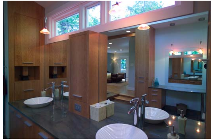
AFTER VIEW – Vanity – Storage Niches – High Window

Additional design elements include: starlight LED lighting above the shower, Giallo Ornamental granite counters, electric floor heating zones and custom cabinetry including integrated storage niches left and right of the sinks. A separate HVAC zone was designed into the addition, in part, to help control excess humidity.