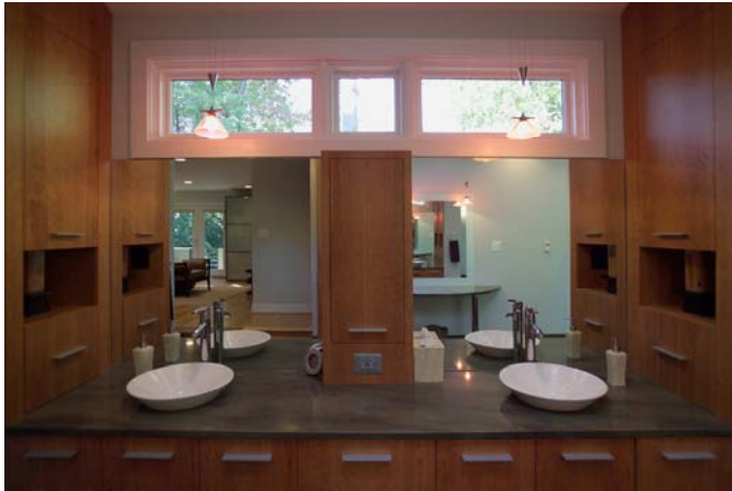
AFTER VIEW – Master Bathroom – Double-bowl vanity