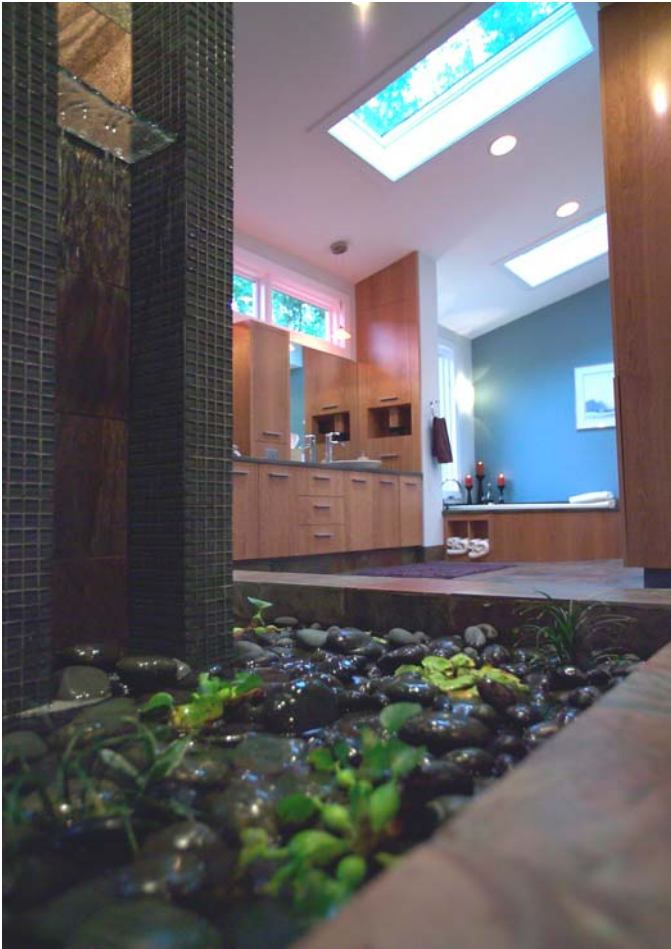
AFTER VIEW – Water Fountain – Vanity – Skylights & High Windows