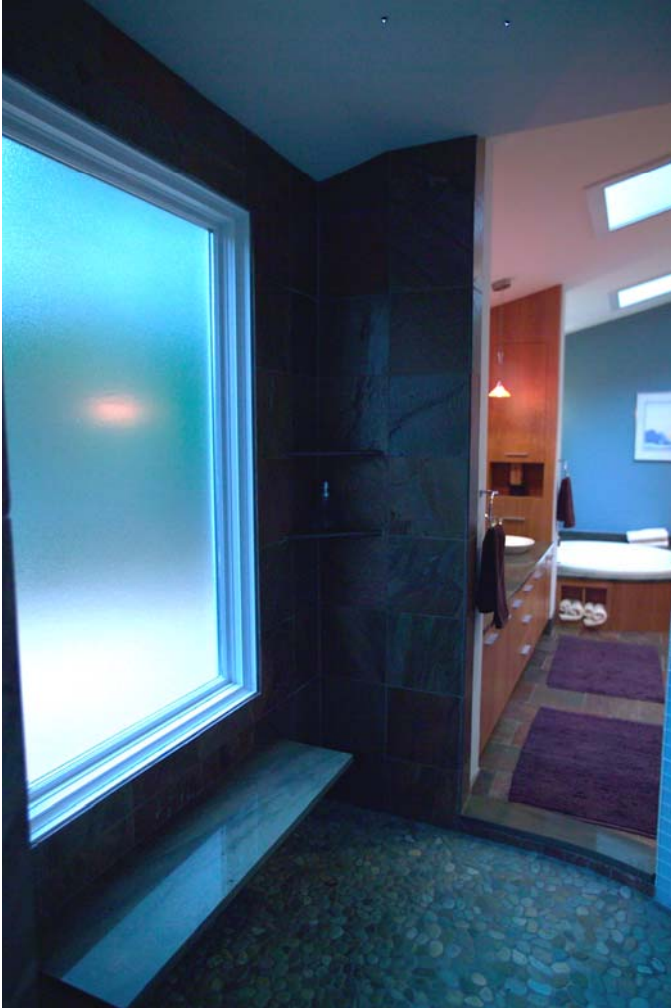
AFTER VIEW – Starlight LED Above Shower - River Stone Floor & Window bench