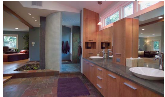
AFTER VIEW – Master Bathroom – Vanity & Master Bedroom