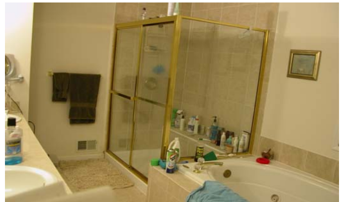
BEFORE VIEW – Master Bathroom – Shower, Tub & Vanity

The homeowner is a successful clothing designer and wanted to make a one-of-a-kind, knock-your-socks-off bathroom. Subsequently, establishing and maintaining her high expectations throughout the design and construction phases proved challenging.