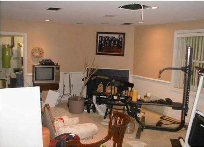
BEFORE PICTURE 3 – View of existing Chimney and access to the mechanical room in the back.