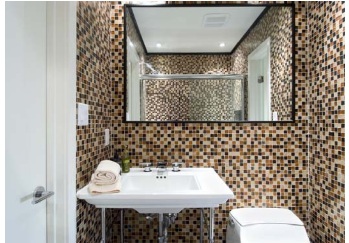
AFTER PICTURE – View of sink & glass mosaic wall tile.