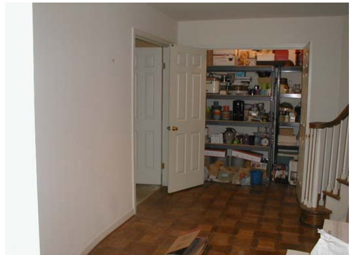
BEFORE PICTURE 2 – View of storage at the bottom of the stairs near existing entrance to Exercise room.

In addition to being inadequate to house the pool table, the existing basement was dark and cramped. The space had been divided into many small rooms including a bathroom that could only be accessed through a laundry area ( See before pictures – right and next page ).