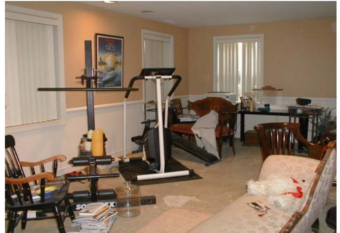
BEFORE PICTURE 1 – View of existing basement used as a studio, entertainment center and exercise room.