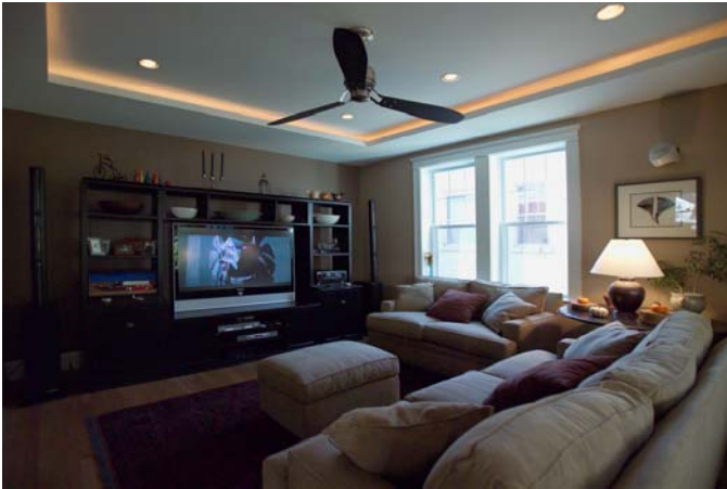
AFTER VIEW – Media Center/Family Room