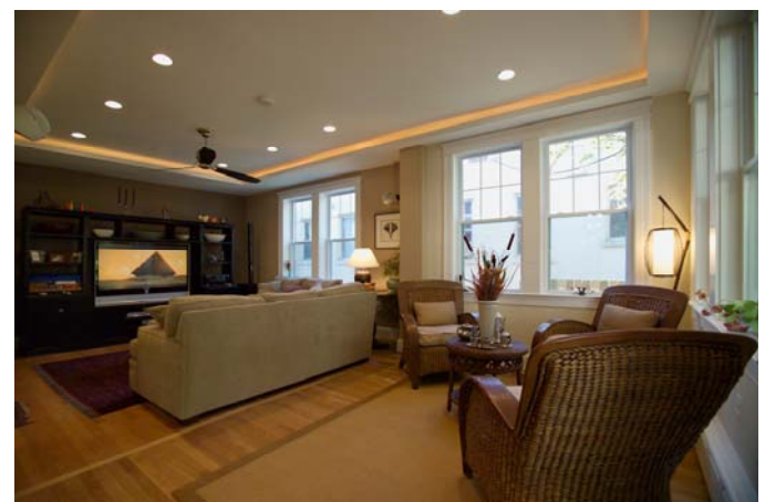
AFTER VIEW – Media Center & Sitting Area