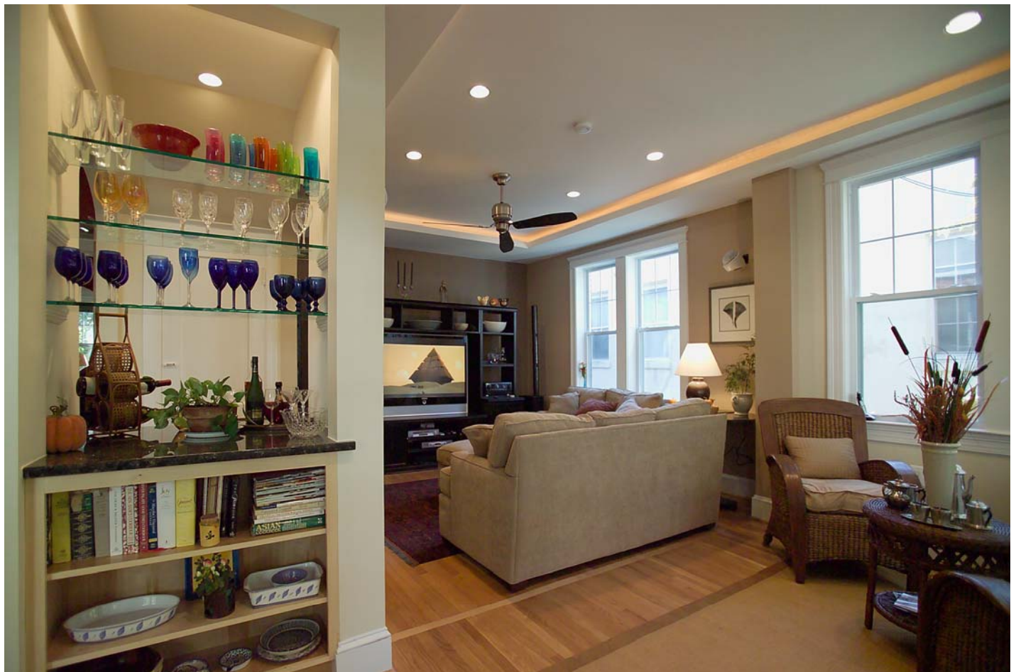
AFTER VIEW – Media Center, Sitting & Bar Area