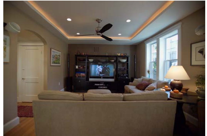
AFTER VIEW – Media Center “The whole room is wired for a carefully designed home visual/audio experience”

of their house before and now it creates a nice flow from the kitchen and dining room and it is used every day.