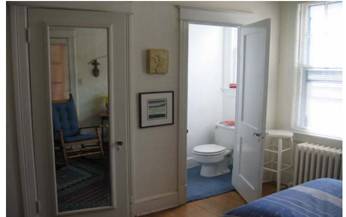
BEFORE VIEW – Existing Bedroom & Bathroom To Be Combined With Rear Porch To Create A More Open Space For Media Room.