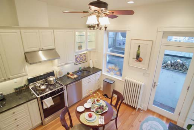
AFTER VIEW – Overall View of Newly Renovated Kitchen in Back of a Row House.