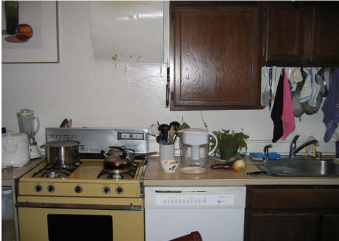
BEFORE VIEW – Existing Kitchen Elevation.

We converted the pantry into a half bath, and installed tall floor cabinets behind the kitchen door to replace our old pantry cabinets (See below).