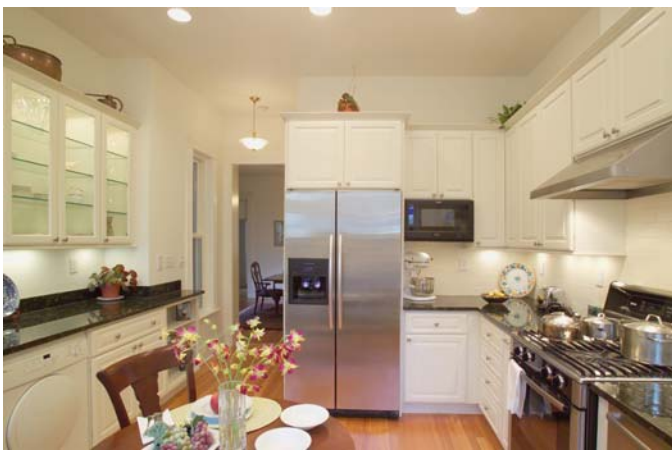
AFTER VIEW – Newly Renovated well-lit Kitchen.