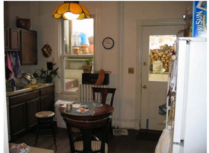
BEFORE VIEW – Existing Kitchen on Rear