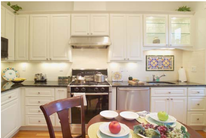
AFTER VIEW – New Kitchen Elevation.

We installed a counter-depth refrigerator and Bosch front-loading under counter washer and dryer (See After Shot Below). The appliances are much better integrated into the space than before.