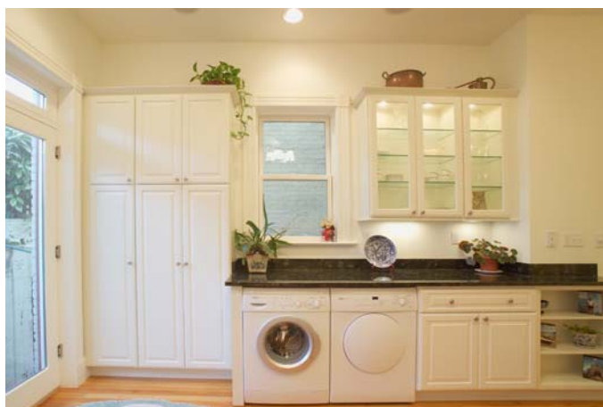
AFTER VIEW – New Kitchen Elevation (opposite).

At Landis's suggestion, we added a new window in our east wall to bring in more natural light. We also converted our half-light door to a full-light door, and added a transom above the door to bring in even more light.