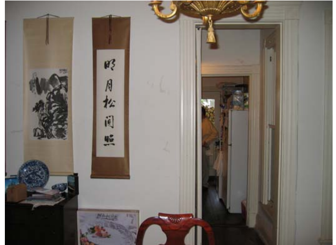
BEFORE VIEW – Existing Hallway Connecting Dining Room And Kitchen. Pantry in the Middle of Hallway Was Replaced By a Powder Room.

We converted the pantry into a half bath, and installed tall floor cabinets behind the kitchen door to replace our old pantry cabinets (See below).