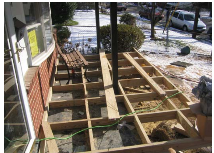
DURING PICTURE 2 – View Of Front Porch framing.

Their front yard is steeper than it looks and required several design iterations. We agreed on a plan that incorporates a wood ramp with safety railing that gradually slopes across the front yard to a landing and concrete walkway. We struggled with the design of the ramp so that we didn’t cut up the yard too badly. During this project we learned the precise distinctions between residential, commercial and assisted access incline codes ( See before & during pictures on the right ).