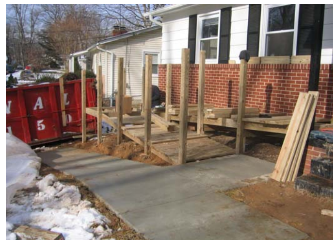
DURING PICTURE – View Of Ramp.