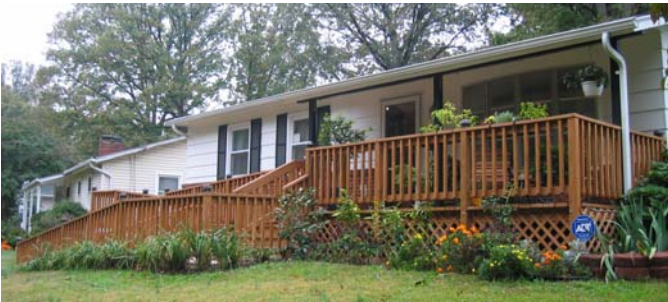
AFTER PICTURE – FRONT FAÇADE