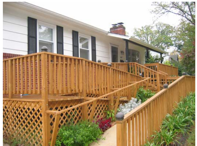
AFTER PICTURE - Exterior view of accessible ramp.