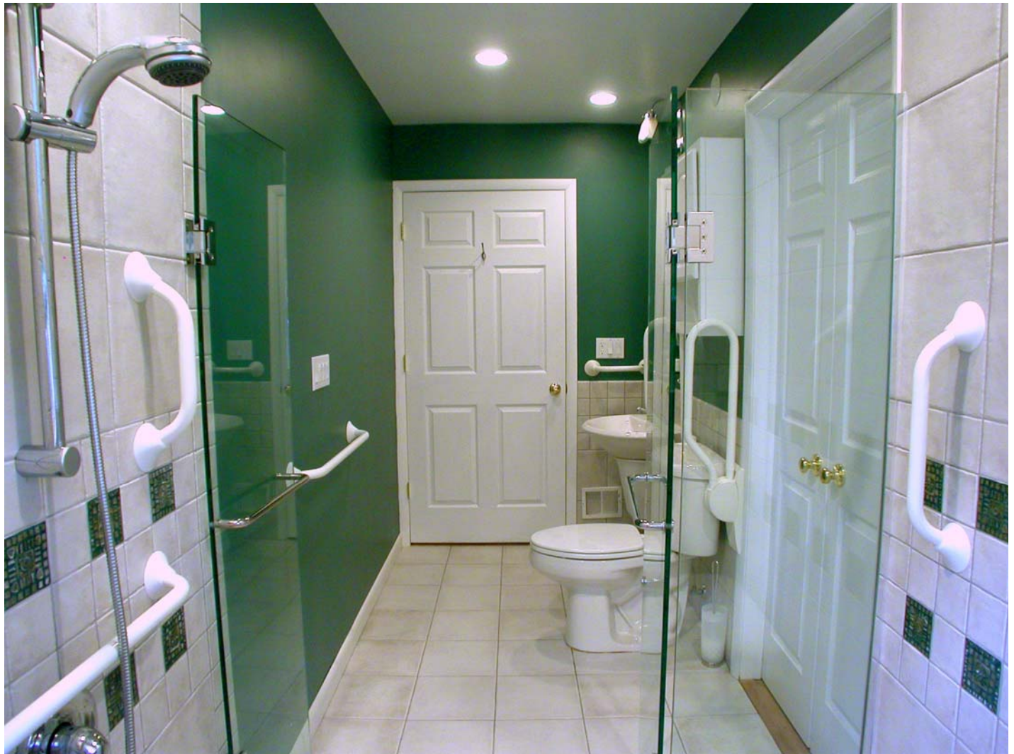
AFTER PICTURE - Interior view of shower's grab bars.