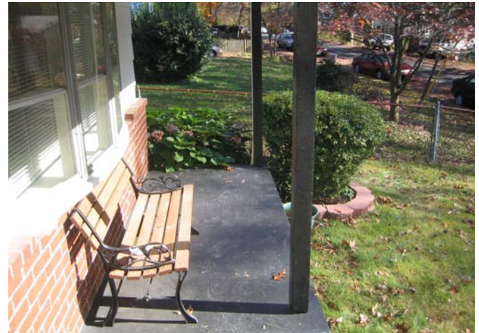
BEFORE PICTURE 1 – View Of Front Porch.