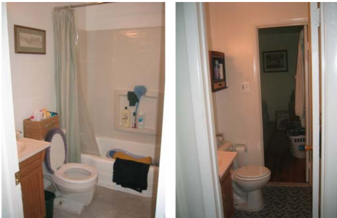
BEFORE PICTURE – View Of ½ & Full Size Bathrooms To Be Combined.

The homeowner’s day-to-day life has been greatly improved by having a wheelchair accessible ramp and bathroom. We were able to bring the project in within the budget and the homeowner is very happy with the quality of craftsmanship and the attention to detail ( See pictures below & next page ).